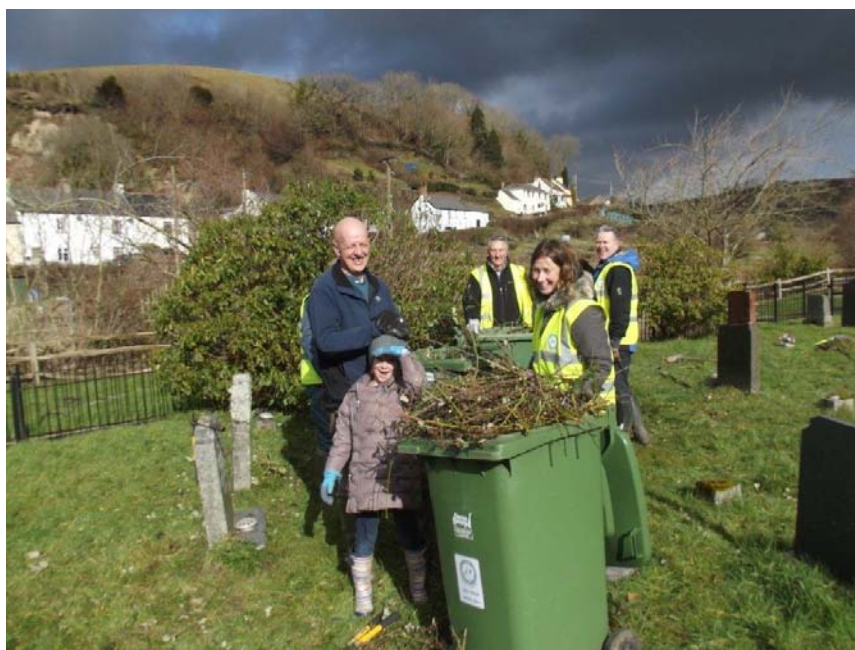
Clearing brambles from the churchyard

The Swimbridge Parish Green Team has not been going long but is already making a difference. As well as work on the highways, village hall and other public areas, families have been helping in the Streamside Garden and churchyard. A big task, enjoyed by the volunteers as a challenge, was the removal of huge amounts of brambles from the yew trees and rhododendrons. The team meets on the third Saturday morning each month. Everyone is welcome, with free refreshments kindly sponsored by the Jack Russell Inn.