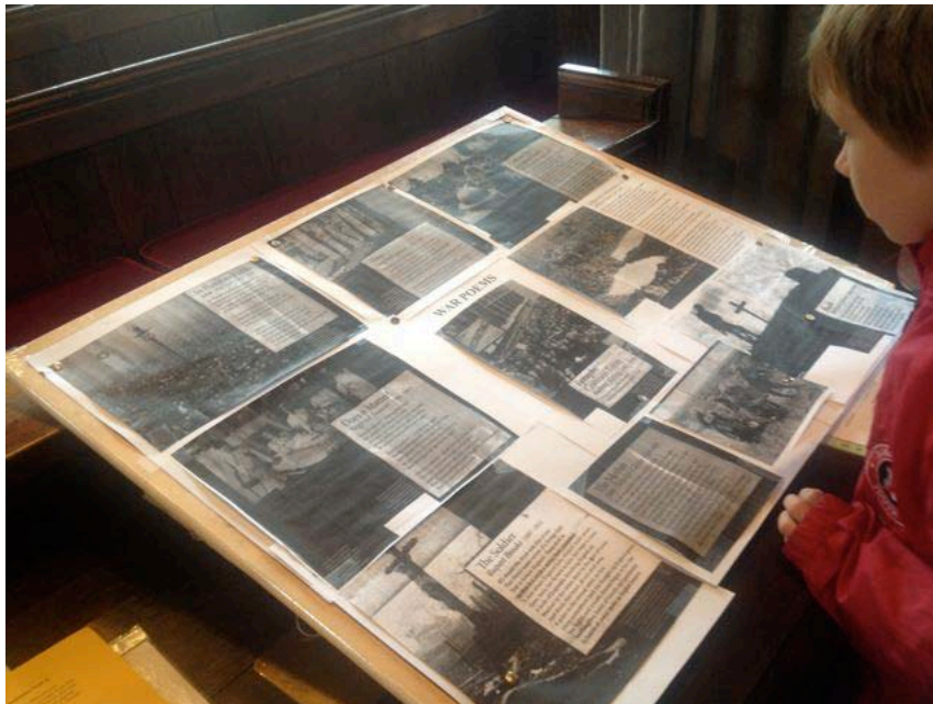
Memorabilia from WW1 in display at church