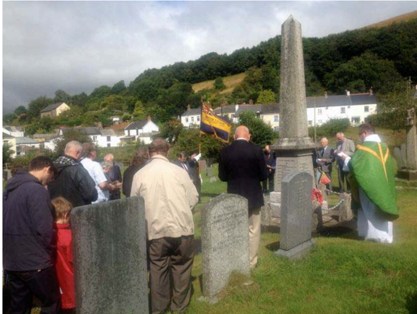
Service of Commemoration of the Centenary of the Outbreak of WW1