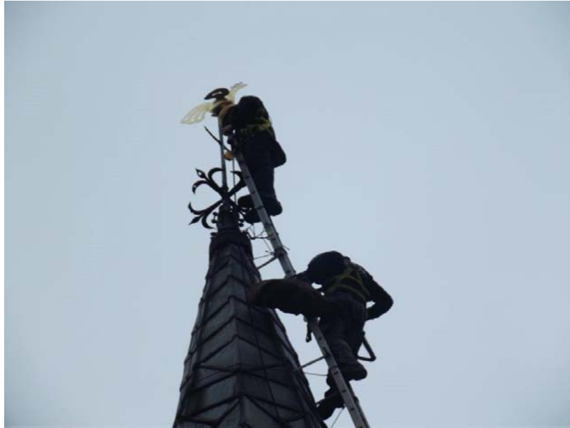
Steeplejacks from Dawsons reattaching the weathercock to the spire of St James after repair and re-gilding